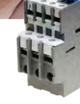
Thermal overload relay for KLIBO7,5 contactor